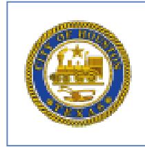
City Seal on white